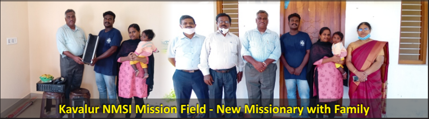
Kavalur NMSI Mission Field - New Missionary with Family