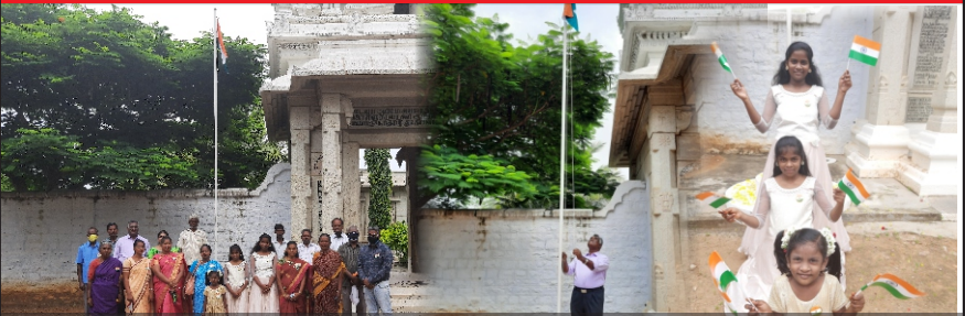
74 th Independence Day @ NMSI C.K. Ashram, Tirupattur

NMS House, 126 Peter's Road Royapettah, Chennai - 600 014, Phone: 044-28418614, 28583804, email: nmsofindia@gmail.com